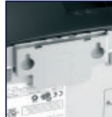
Wall mount bracket automatically included with printer at purchase