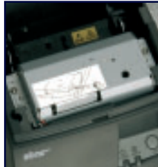
Robust, high speed guillotine cutter for increased reliability