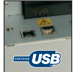
Full Speed USB interface with selectable serial port emulation