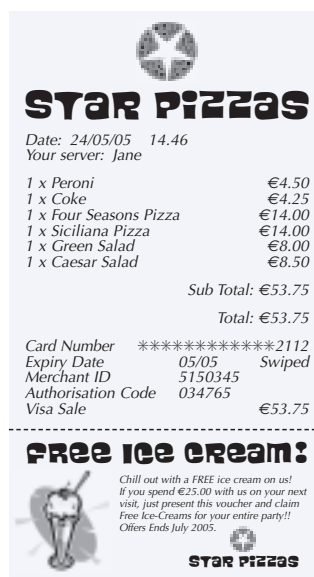
Typical example of receipt with TrueType fonts and Graphics