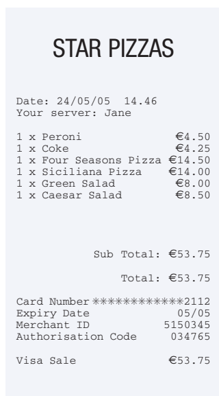
Typical example of receipt with Resident Fonts