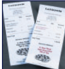
Two-colour output with running costs comparable with other POS technologies