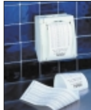
Wall Mount Option demonstrating Data Logging