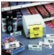
Shelf Edge Labelling