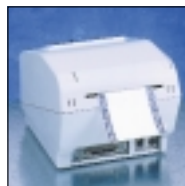
External Paper Feed Path